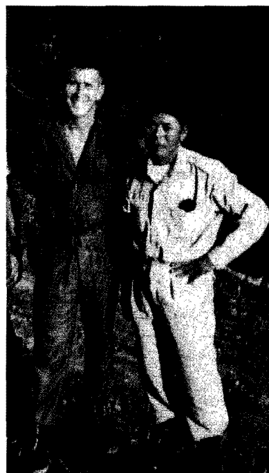
The author and a Hmong resistance fighter in Laos in mid-1962.

The Simbas, a ragtag bunch of illiterate dissidents, certainly were not Communists, but they posed a threat to the pro-Western government in Leopoldville led by Moise Tshombe. Thus, they gained the support of the Soviet Union, China, and their client states, thereby