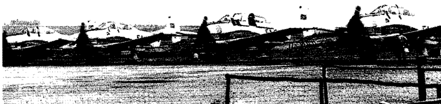
T-28s in Bunia.

A few days later, my communications officer drove me out to the airport. The chief of the air unit had agreed that this would be a good time for me to get a look at the terrain, road network, and level of activity visible from the air in the area north of Bunia along the border with Sudan. We suspected some arms and ammo for the Simbas were being infiltrated via that border. The two T-28s made daily flights out of Bunia looking for "military targets"—almost anything that moved on the roads. That day, they had been scheduled to cover the area I was interested in.