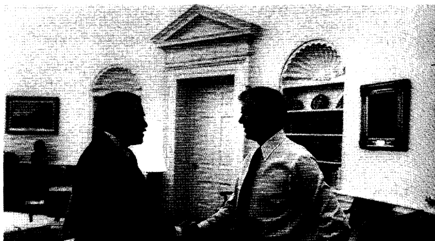
President Jimmy Carter expresses his appreciation to author for his key role in the exfiltration operation.

I showed the President some of the cover materials used in the operation and told him the Argo/Argau story. Because of some indecision about whether the White House photographer should take my picture shaking