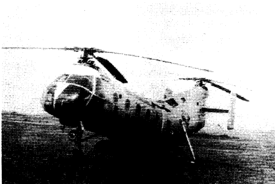
Belgian rescue helicopter.

any sort of consciousness were diminishing. Days passed in a fog. I did not know about the arrival and crash of the Belgian helicopter.